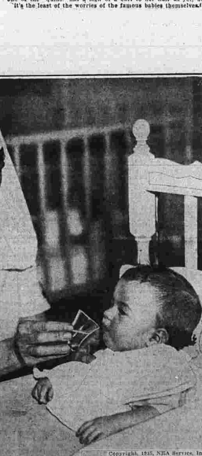
Marie is Making Sure That Bottle Won't Get Away From Her