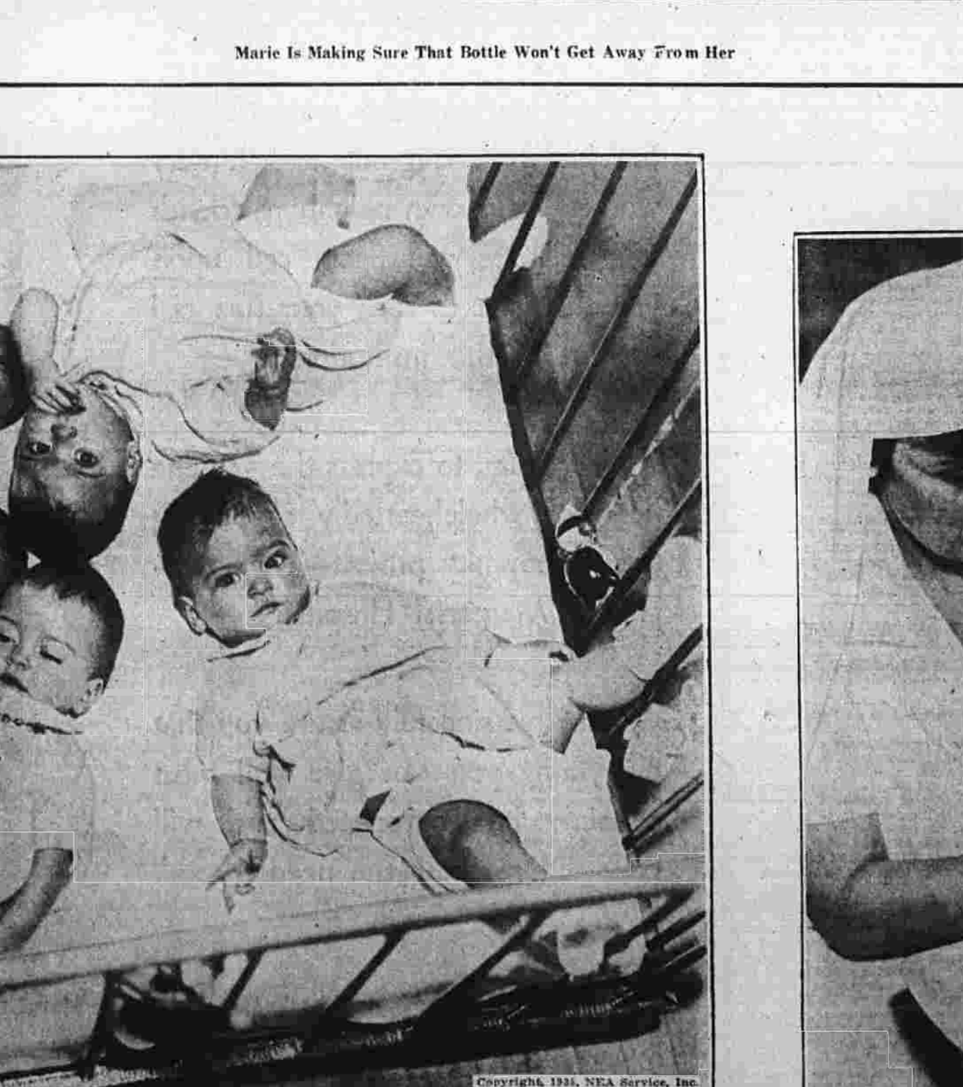
The Datoe quintuplets get their heads together on plans for the coming summer. Cecil, foreground center, stretches out his arms and regards her footed feet. Yvonne, far right, is covering her mouth with her hand. Marie, center, is looking towards the camera. Annette, far left, is looking towards the camera. Yvonne, far right, is looking towards the camera.