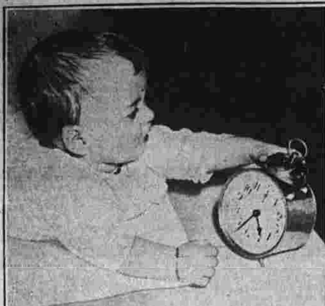
Coops, watch out! That clock'll be on the floor in a minute! Yvonne's caution is backed up now by comfortable strength, and even this busy alarm clock is scarcely safe anywhere when her fat little fist gets a grip on it.